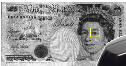
British five pound note